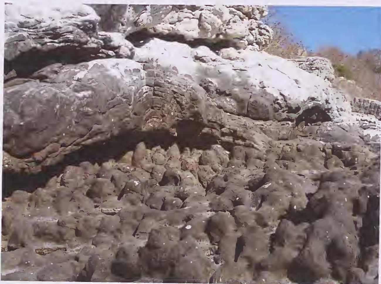
Figure 7. Two forms of stromatolite, about 3 m above high tide level on the northern side of a small islet south of Ngalanguru Island, High Clifty Group.